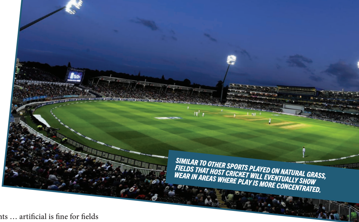
SIMILAR TO OTHER SPORTS PLAYED ON NATURAL GRASS, FIELDS THAT HOST CRICKET WILL EVENTUALLY SHOW WEAR IN AREAS WHERE PLAY IS MORE CONCENTRATED.

“For a top-quality event, we need a natural-turf pitch, which is quite expensive to manage and not affordable for most of the recreational leagues. There are only three cricket pitches in the entire USA that are approved to host international matches, and that meet the necessary standards. For our youth events ... artificial is fine for fields that meet the size requirement as per the age level.”