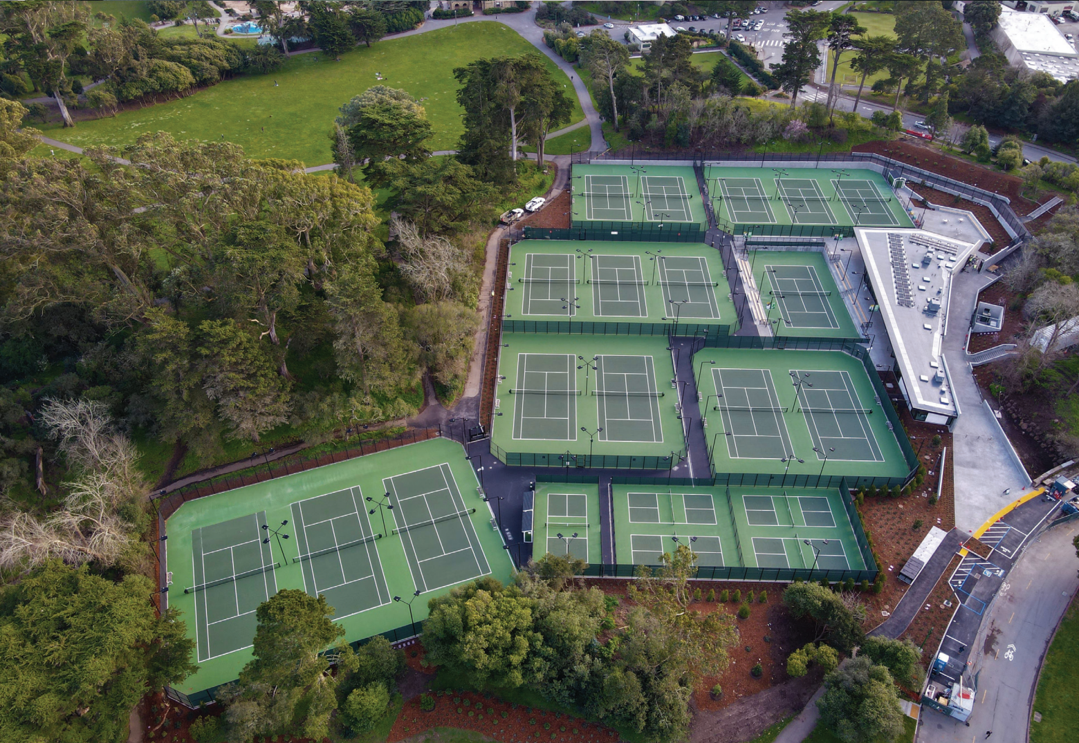
COURTESY OF BYRNE & JONES CONSTRUCTION (TOP) COURTESY OF VINTAGE CONTRACTORS INC. (BOTTOM)