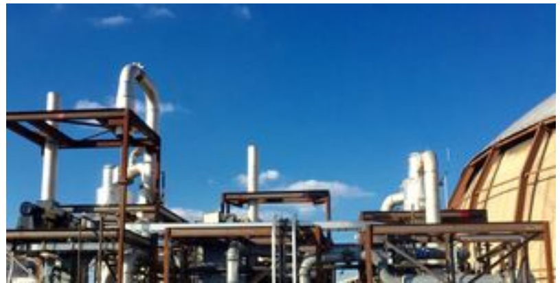
The dryer, devolitiser and stabiliser (left to right) of the test plant facility

Work has not stopped with the site selection; in fact, it seems it is just beginning. Plans are in progress to look at byproduct extraction and methods to further enhance the product by continuing to increase Btu. CCTC is certainly in the perfect place for it, with PRB coal lending itself well to lower overall mining costs, though Neary stresses that the key is for the technology to be scalable to all coals, domestic and international.