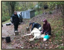
Many thanks to the ASPCA for funding this project!