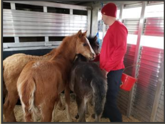
Many thanks to The Right Horse for funding this project!

T.R.O.T. (Transport & Relocation Operations Team)