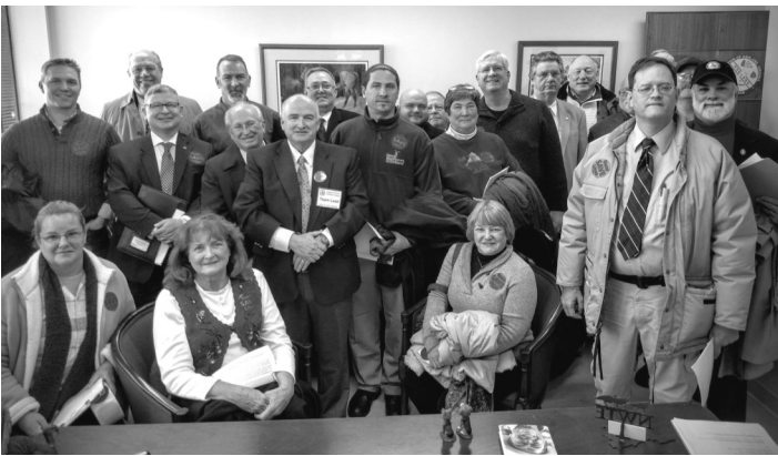
A group prepares to meet with a legislator.