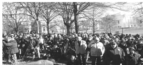
Look at that crowd!

state buildings, a reminder of why we work for our rights on Martin Luther King Day, and efforts to bring our actions to the attention of non-