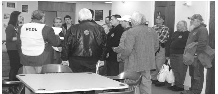
A group waits for a legislative aide.

First-time attendees overwhelmingly offer two comments. First, they appreciate the opportunity. Second, they are grateful to those who serve as team leaders and who are willing to walk newcomers through the process.