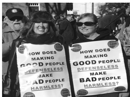
VCDL Members asking common-sense questions .