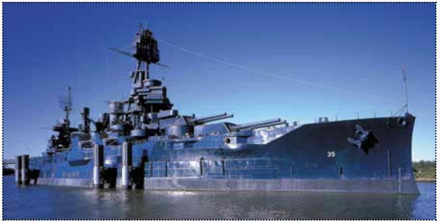
Battleship Texas: The first battleship memorial museum in the U.S. is currently anchored on Buffalo Bayou and the Houston Ship Channel, near the San Jacinto Monument and Museum.