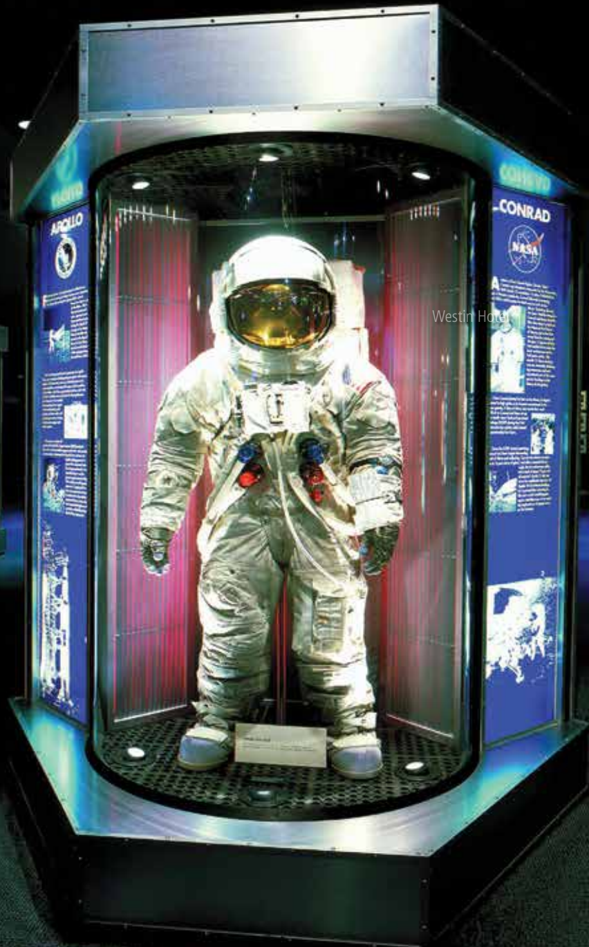
Space Center Houston: This unparalleled exhibit features spacesuits dating back to the first American trip to space and a wall that contains portraits and crew photos of every U.S. astronaut who has flown in space.

If you want to venture further out, spend the day exploring the Museum District, the country’s fourth largest, with 18 cultural powerhouses set within blocks of one another or head down to Space Center Houston, the official visitor’s center for NASA’s Johnson Space Center. Later on, grab a bite in one of dozens of award-winning restaurants, or hang out with the cool kids on Washington Avenue. There’s always something to do in this Southern hospitality meets urban chic city!