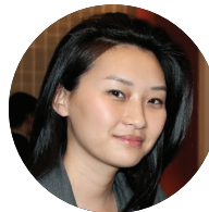
NAF KWUN VP, PROGRAMS AND OPERATIONS