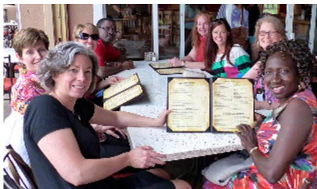
A convenience sample of AALHE members at the annual conference overwhelmingly indicated food and friendship as two reasons to attend.