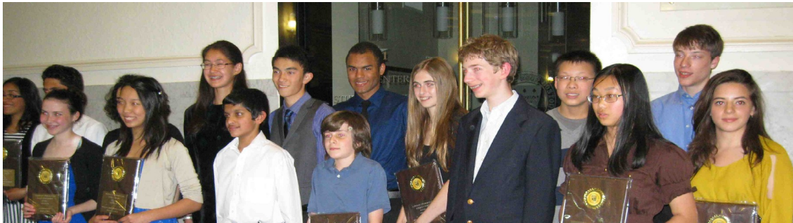
Group Photo of Top NSE Winners in Massachusetts