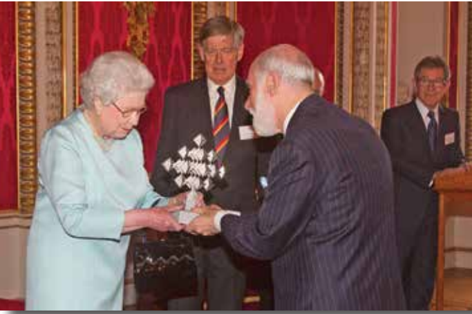
In 2013, Vint was one of five Internet and Web pioneers awarded the inaugural Queen Elizabeth Prize for Engineering.

focus and vigorous outreach is needed and justified to raise awareness about the important benefits of cochlear implants.