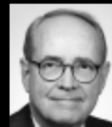
Honorable Richard L. Thornburgh Kirkpatrick & Lockhart LLP Washington, DC