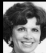
Professor Nadine Strossen President, American Civil Liberties Union New York Law School New York, NY