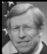
Honorable Theodore B. Olson Solicitor General U.S. Department of Justice Washington, DC