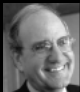
Honorable George J. Mitchell Piper Rudnick LLP Washington, DC