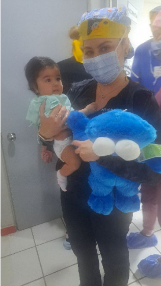
Heading back to the operating room...