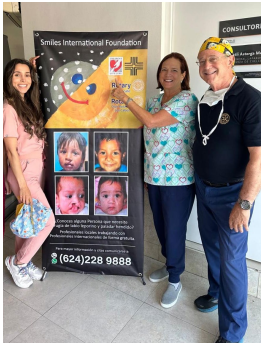
Here is a nice photo with some of the team taken last August with one of our Rotary Club Tecate/Los Cabos' new posters used around town for patient advertising.