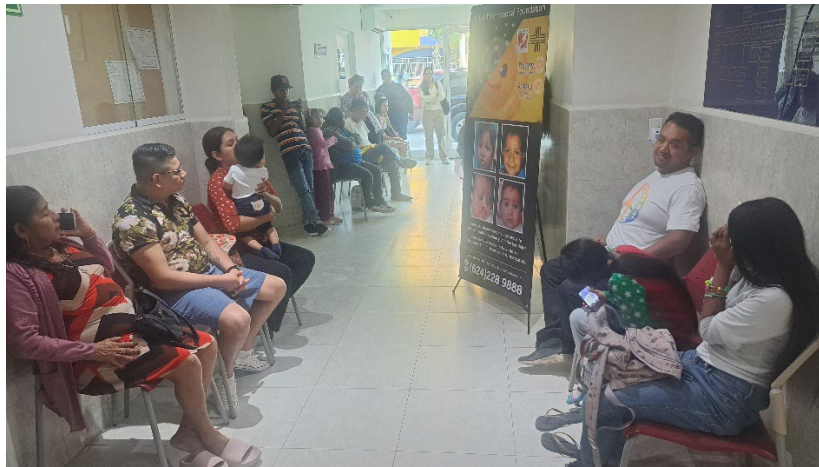
Patient screening was very busy as usual.