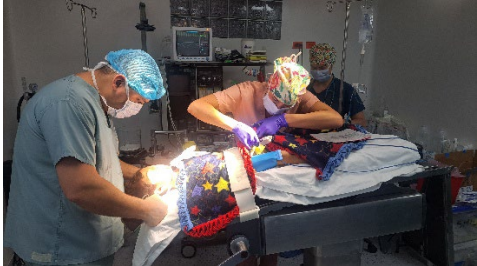
Team gets everything safe and ready...