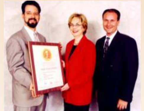
Our founder receiving federal award