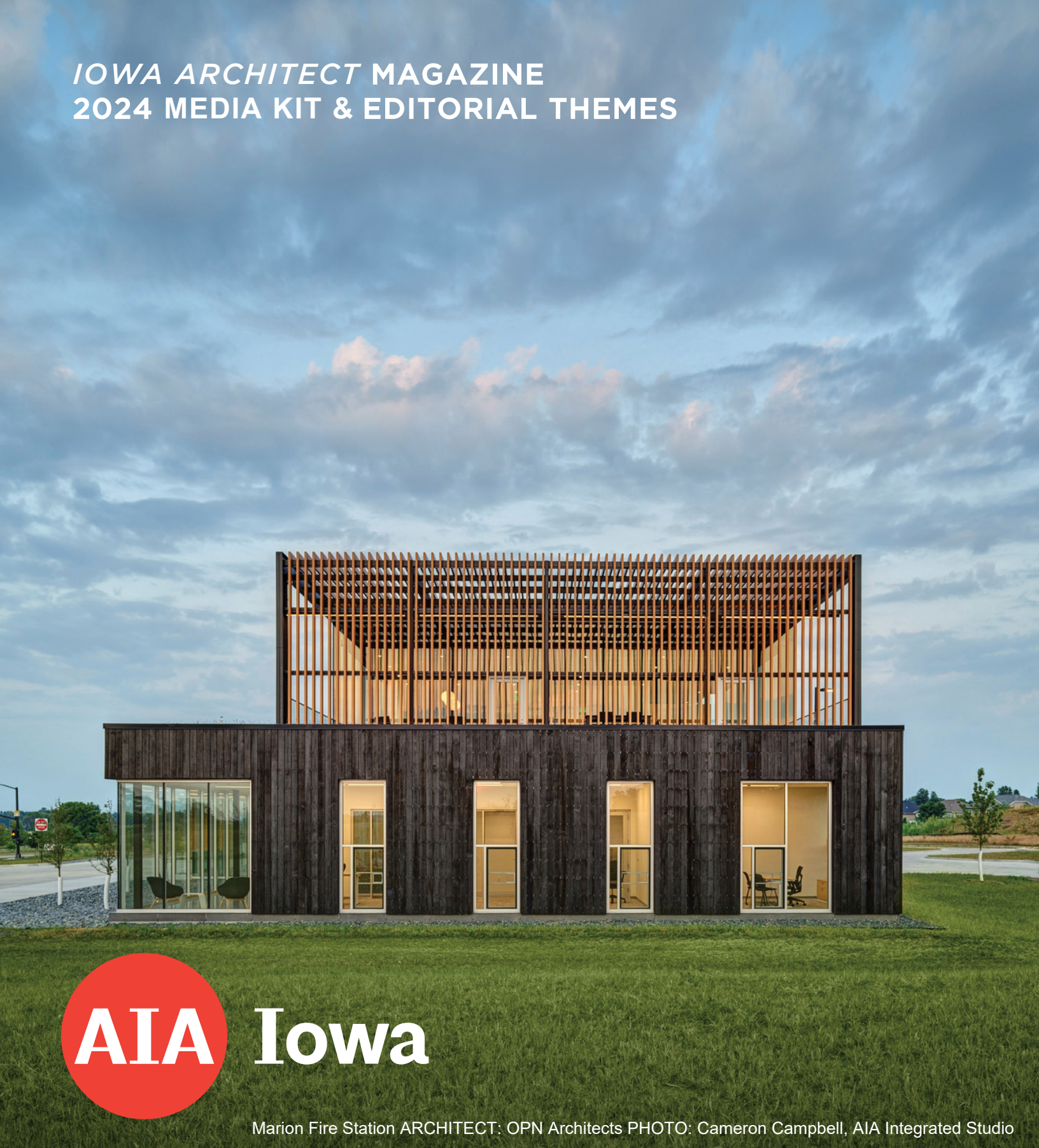
Marion Fire Station ARCHITECT: OPN Architects