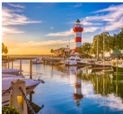
Hilton Head, SC - Nov. 4-7, 2021