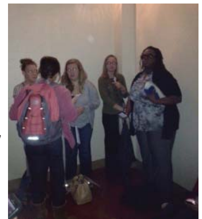
Conference attendees network while waiting out the tornado warning in the gym.

This affiliate is familiar with battling weather issues during conferences. Two years ago, on the day of a conference, a snow storm hit Alabama preventing many from attending. Maybe next year the conference should be held in Orlando!