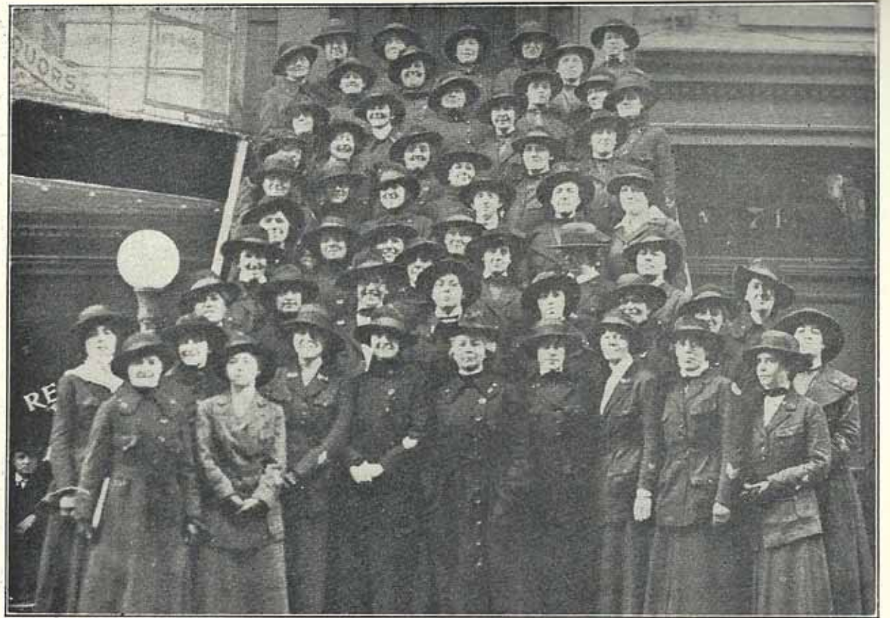
NURSES OF BASE HOSPITAL No. 6