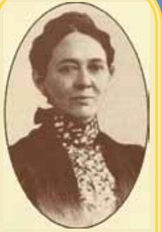
Who is this nurse? See Page 10