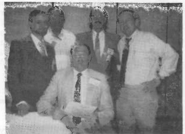
CONGRATULATIONS TO THE NEW AOOD EXECUTIVE COMMITTEE