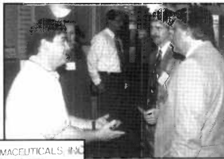
Orino Pharmaceutical/Derm Division