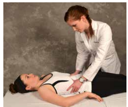
Figure 3. Redoming the abdominal diaphragm (MFR)