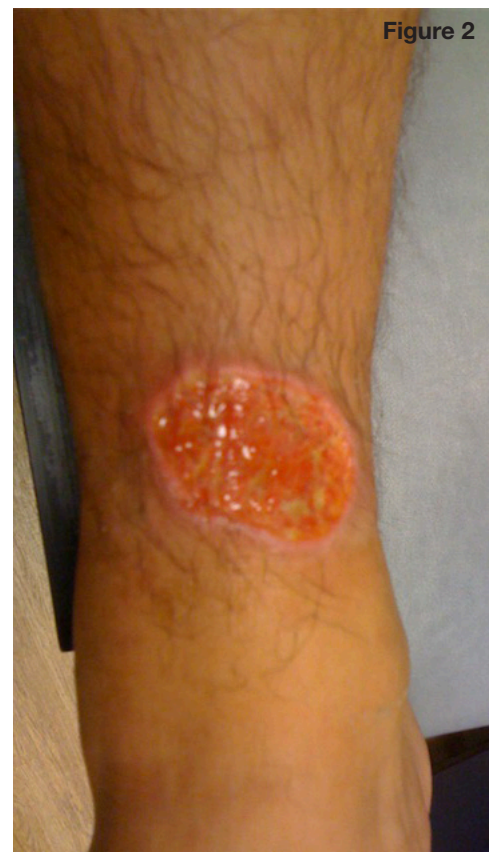
Figure 2. Ulceration on ankle due to leishmaniasis.

Finally, if visceral leishmaniasis is suspected, one should obtain the rK39 serologic testing. The rK39 ELISA test detects circulating antibodies against the recombinant K39 protein. Recombinant K39 protein is an epitope present on amastigotes of Leishmania species that causes visceral infection. Research in India has shown an