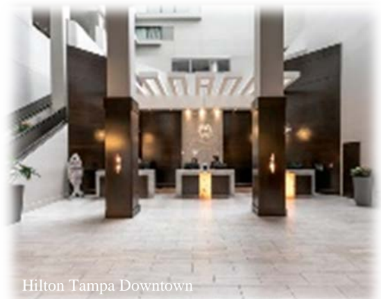
Hilton Tampa Downtown