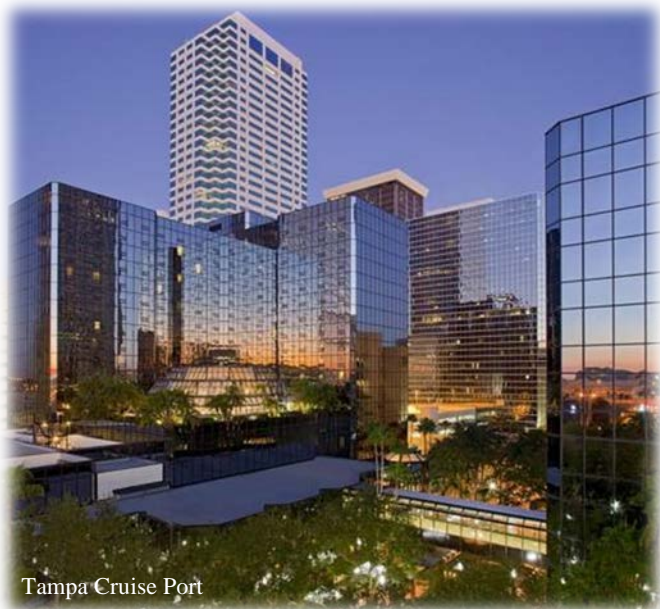
Tampa Cruise Port

The AOCR negotiates competitive group rates on behalf of attendees for each CME conference. As part of these hotel negotiations, the College is required to sign a contract guaranteeing a specific number of hotel rooms being sold within the group block. If this guarantee is not met, the College is financially responsible for that shortage. All of this is considered when setting the registration rate for each CME conference. Therefore, we encourage all attendees to consider staying in the conference hotel. This will help to ensure that the College is able to keep registration rates for future CME conferences as low as possible.