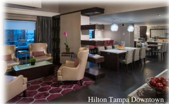
Hilton Tampa Downtown