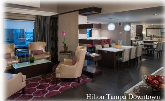
Hilton Tampa Downtown