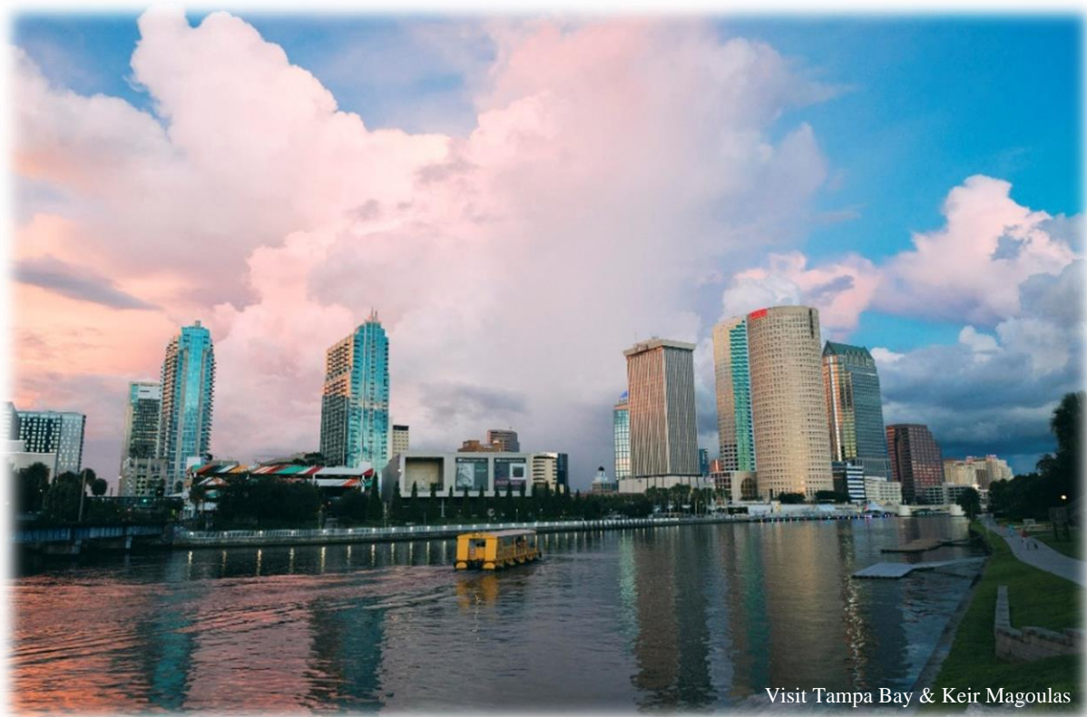
Visit Tampa Bay & Keir Magoulas