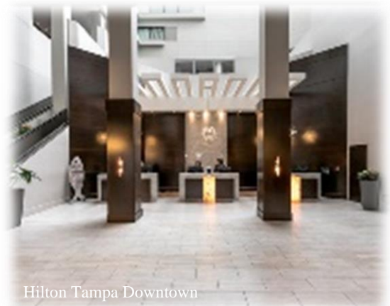
Hilton Tampa Downtown