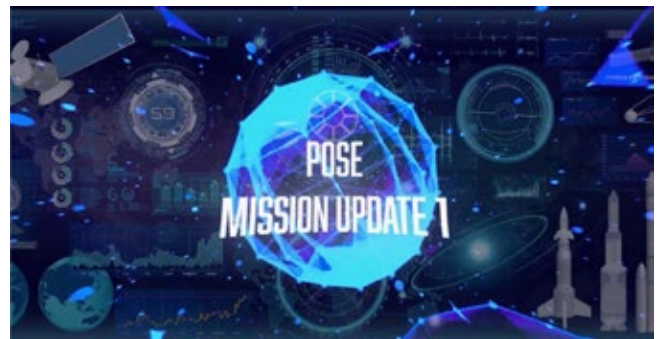
Figure 2. Video banner for our first mission update.

In our first update (Figure 2), NASA launched two humans and two sentient AI cyborgs to Mars to search for life, but a malfunction due to space debris caused insufficient power to be generated by the solar panels, meaning either the power-hungry AI cyborgs had to be powered down (leading to their permanent demise) or the oxygen scrubbers, essential for the human life support system, had to be stopped. The questions were as follows: Which path should be followed? Why this path? What effects will it have to the mission objectives? Finally, what ethical guidelines might be involved in this choice?