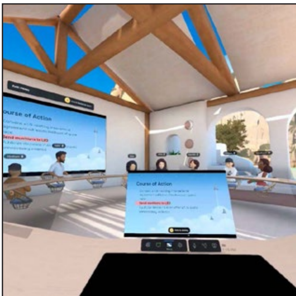
Figure 1. Discussion in the VR environment, showing the student avatars, the presentation from a real computer and a projector to the main screen, seen from the point of view of the authors. The avatar “look,” clothing, etc. were selected by the user and could be updated, but we note that the students and faculty chose avatars that physically looked and dressed like the person in real life. Their arms and hands moved in synchronicity with the person in real life.

We also hosted VR weekly discussions of the materials covered in that week’s class (Figure 1). We chose to do this online (synchronously) to offer location flexibility to the students, and, in the VR environment, to understand the pros and cons of doing so. Students were free to make their own avatars and would be randomly positioned around a large virtual round table where discussions could be made, as well as virtual presentations from “real” computers projected to the virtual world. In the early classes it was notable that some students were more vocal than others, but as the novelty of the VR environment passed, even students who self-identified as shy spoke often and with conviction. Indeed, some of those we spoke to suggested that having an avatar presence rather than their real physical presence made voicing their opinions easier.