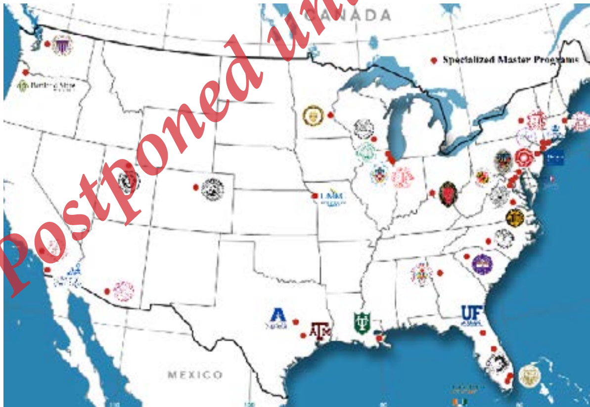
Map shows some of the over 80 specialized masters program in the US