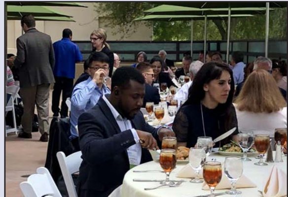
ARES Doctoral Luncheon and Seminars from previous years