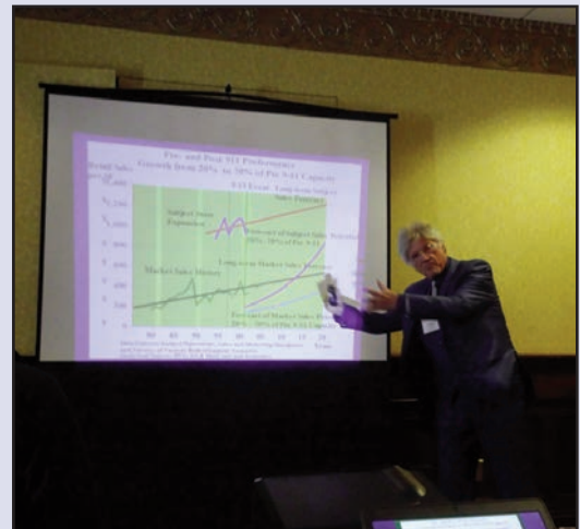
ARES Sessions and Panels from previous meetings