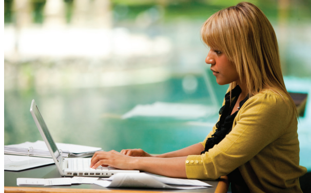
The program is taught entirely online by experienced faculty who are noted experts.

Taught entirely online, the Advanced Studies certificate programs prepare audiologists to become experts in a specialized area. Each curriculum is designed to expand students' knowledge, provide needed skills and expertise, build confidence in the delivery of clinical services and present the latest on the state of science in each specialty area's technology and treatment, with special emphasis on current research.