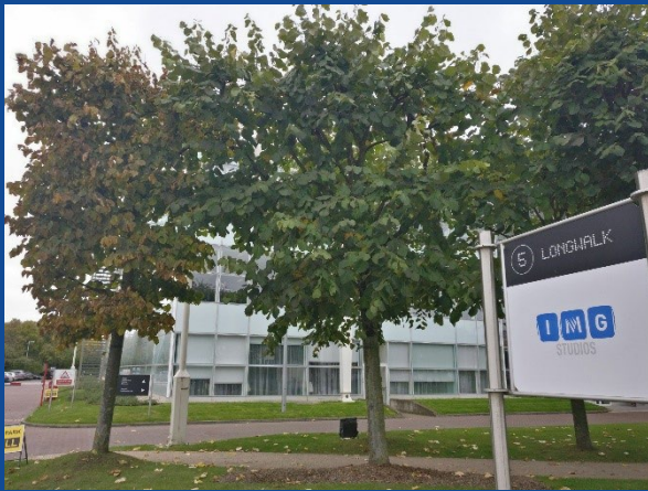
Photo 13: Untreated lime (left hand side) Vs treated lime (right hand side)