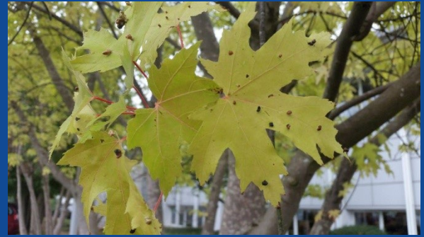
Photo 4: Symptoms of leaf yellowing/chlorosis caused by soil compaction.

In such scenarios, the common practice among business parks is to wait until a tree no longer provides aesthetic or functional benefits or is deemed structurally unsound and poses a potential hazard to traffic, buildings, and pedestrians, before removing it. This approach is usually adopted as this is perceived as the most cost-effective approach in these situations. However, this approach is flawed as it eliminates the numerous functional benefits trees offer, such as providing shade, deflecting and absorbing noise, reducing wind velocity and solar glare, filtering dust and ultraviolet light, and absorbing vehicular pollutants. Additionally, the removal and replanting of large trees can be more costly and labor-intensive than anticipated, which are likely what the landowners sought to avoid by pursuing this strategy in the first place.