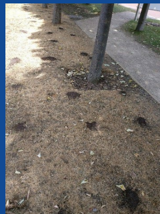
Photo 8: Vertical mulching trial prior to addition of wood chip over the soil surface.