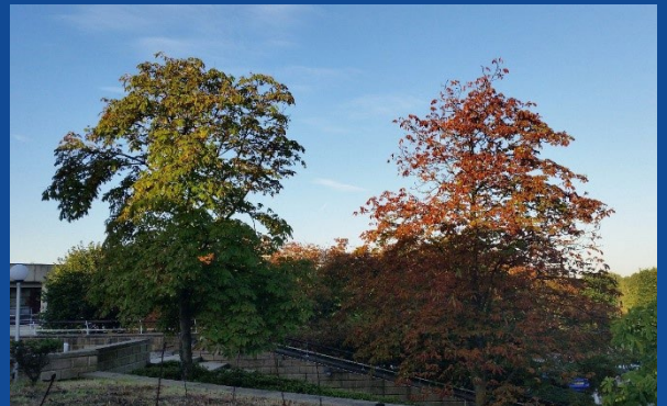
Photo 14: Treated horse chestnut (left hand side) Vs untreated horse chestnut (right hand side)

Photographs 13-14 illustrate the outcomes of de-compaction treatments after three years, including improved visual appearance, enhanced crown coverage and root growth, reduced leaf yellowing and chlorosis, improved leaf photosynthetic efficiency, increased stem extension and girth increments, and reduced crown die-back.