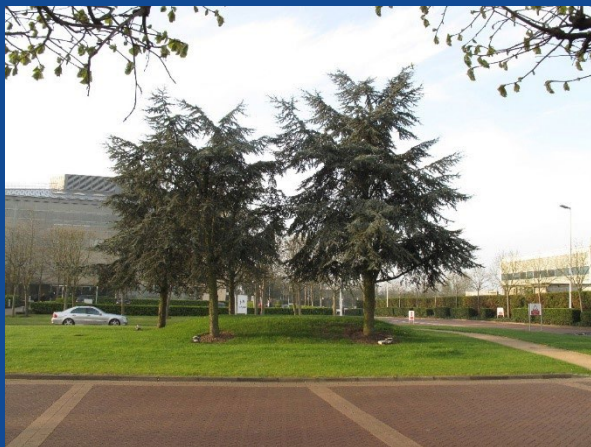
Photo 1: Blue cedars forming part of the visual landscape at Stockley Park.

Despite these efforts, Stockley Park faces several environmental challenges typical of highly manicured urban landscapes. These include soil compaction from landscape and construction machinery as well as pedestrian traffic, limited water infiltration and soil volumes leading to drought conditions, and elevated atmospheric pollutants from vehicular traffic. These environmental stresses have adversely affected the health and vitality of the planted trees and shrubs, resulting in poor canopy coverage, limited stem extension growth, sporadic branch, stem, and leaf die-back, stem lesions, and yellowing and chlorotic leaves. Additionally, weakened trees have become susceptible to pest attacks, such as those from the horse chestnut leaf miner and oak processionary moth where heavy and frequent outbreaks have been recorded.