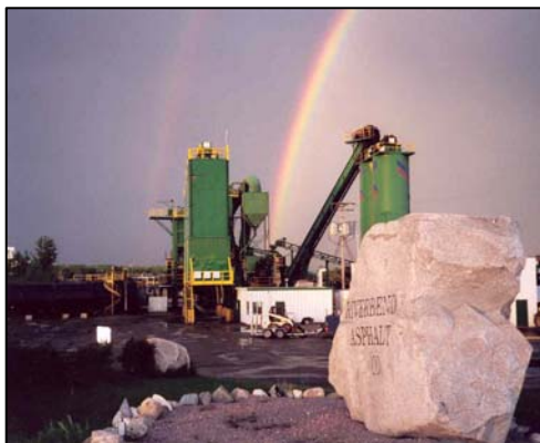
River Bend Asphalt Co. Kasota Plant