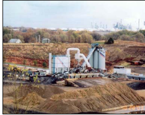
Bituminous Roadways, Inc. Inver Grove Heights and Shakopee Plants