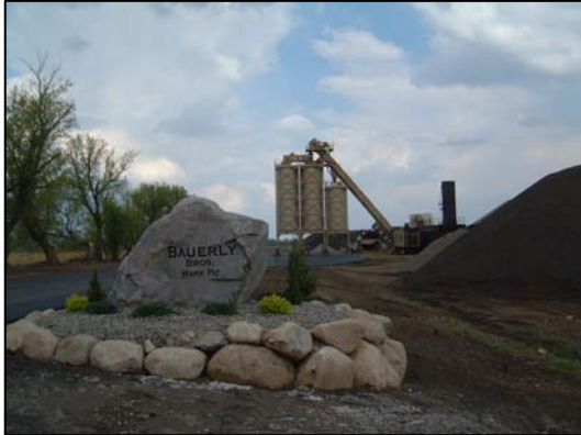
Knife River Corp. - North Central North Branch and St. Cloud Plants

Those who earned the Diamond Achievement [NAPA] and Ecological [MAPA] Commendation Awards in 2008 are as follows: