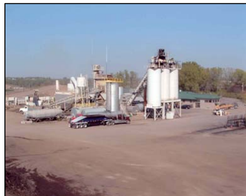
Tower Asphalt, Inc. Lakeland Plant