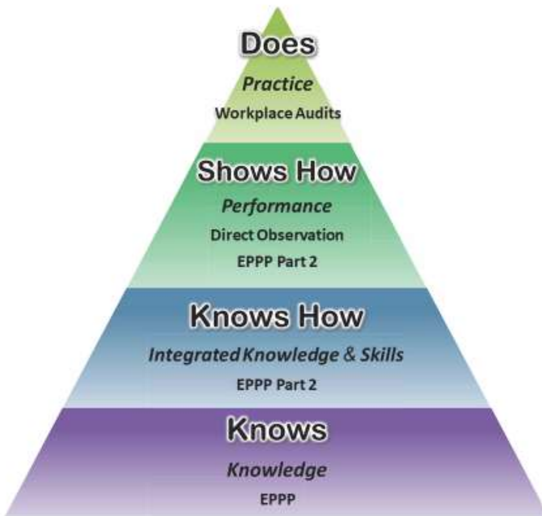
ASPPB Pyramid for the Assessment of Competence

The CATF’s adapted version of Miller’s Pyramid for assessing competency for licensure in psychology is shown below.