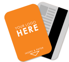
Hotel Room Keys