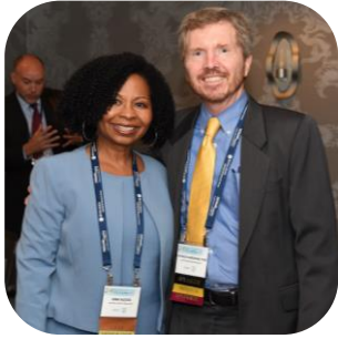
Lanyard & Name Badge