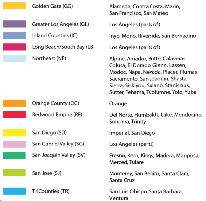
Counties the Districts Encompass

See the Mailing List Order Form for more details.