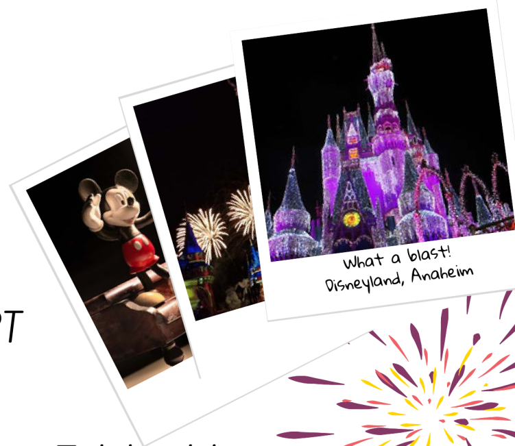
What a blast! Disneyland, Anaheim