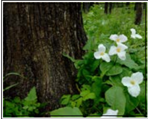
Chicago Botanic Garden McDonald Woods