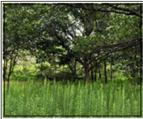
Forest Preserves of Cook County Powderhorn Marsh and Prairie Nature Preserve