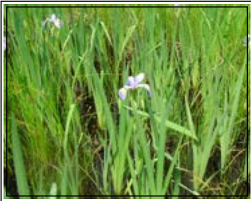
Forest Preserve District of Will County Braidwood Dunes and Savanna Nature Preserve