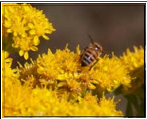
McHenry County Conservation District Nippersink North Branch Conservation Area