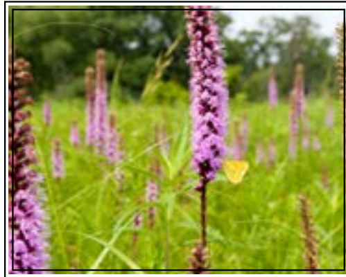
Lake County Forest Preserves Spring Bluff Forest Preserve