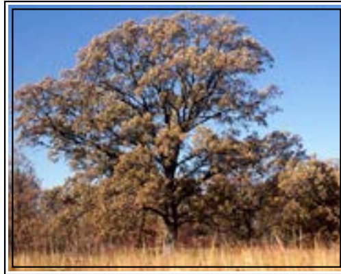
Forest Preserve District of Kane County Dick Young Forest Preserve