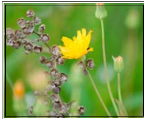
The Nature Conservancy Indian Boundary Prairies