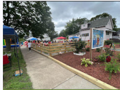
Adopt a Lot Program