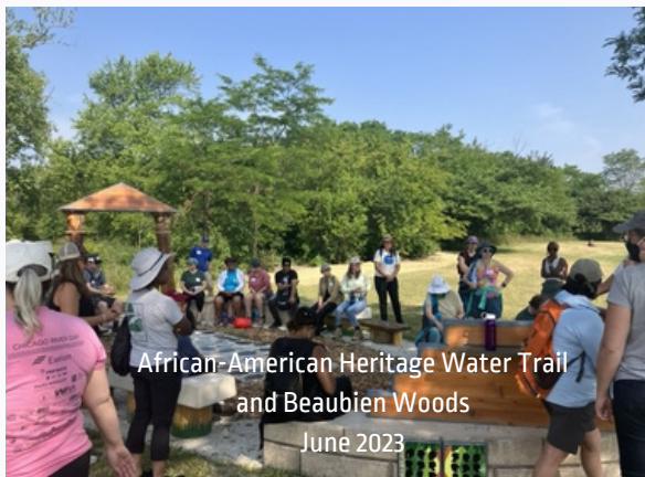
African-American Heritage Water Trail and Beaubien Woods June 2023

Field Trips were funded by Nicor Gas in 2023. The trips are potent sources of energy for the Alliance. All four Field Trips sold out, proving that you are eager to be outdoors to learn about conservation innovations and meet your peers.