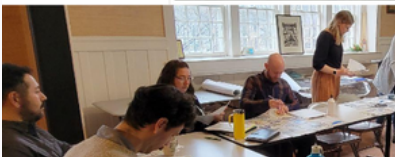
Conservation Action Planning in Calumet Region Partnership