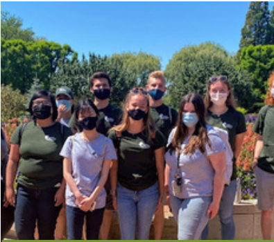
Youth Outdoor Ambassadors Forest Preserves of Cook County