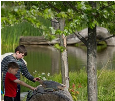
Green Belt Forest Preserve Lake County Forest Preserves PLATINUM