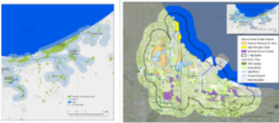
Chiwaukee Prairie-IL Beach Lake Plain Partnership