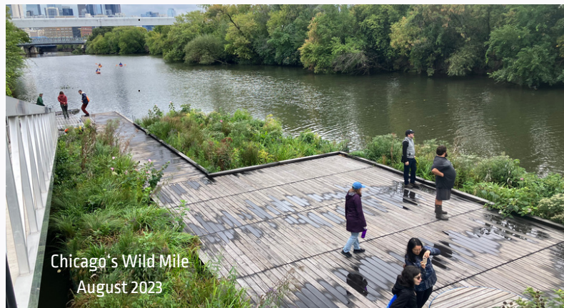
Chicago's Wild Mile August 2023