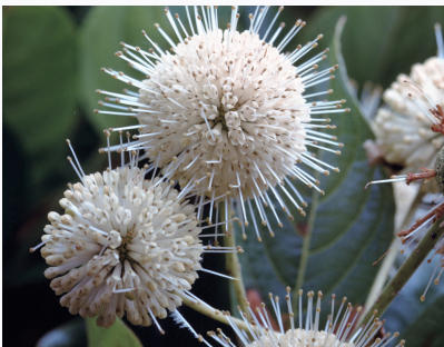
Sand Ridge Nature Preserve Forest Preserve District of Will County GOLD