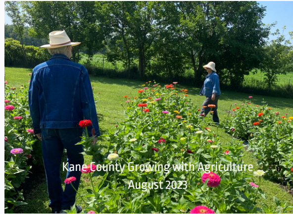
Kane County Growing with Agriculture August 2023