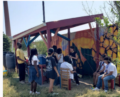
Little Village Environmental Justice Organization Farm