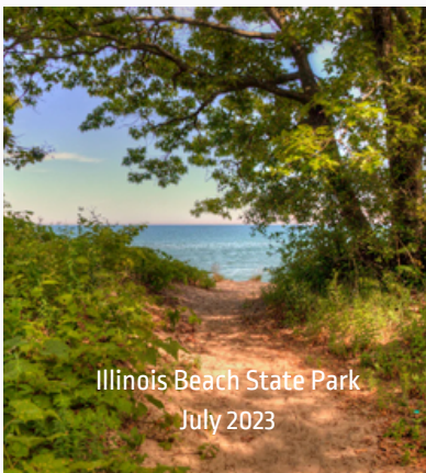
Illinois Beach State Park July 2023