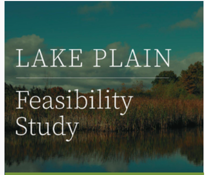
LAKE PLAIN Feasibility Study