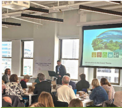
Natural Solutions Tools