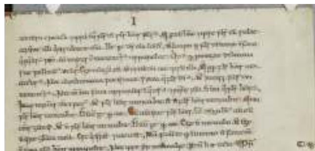
CCCC MS 199, f. 11r