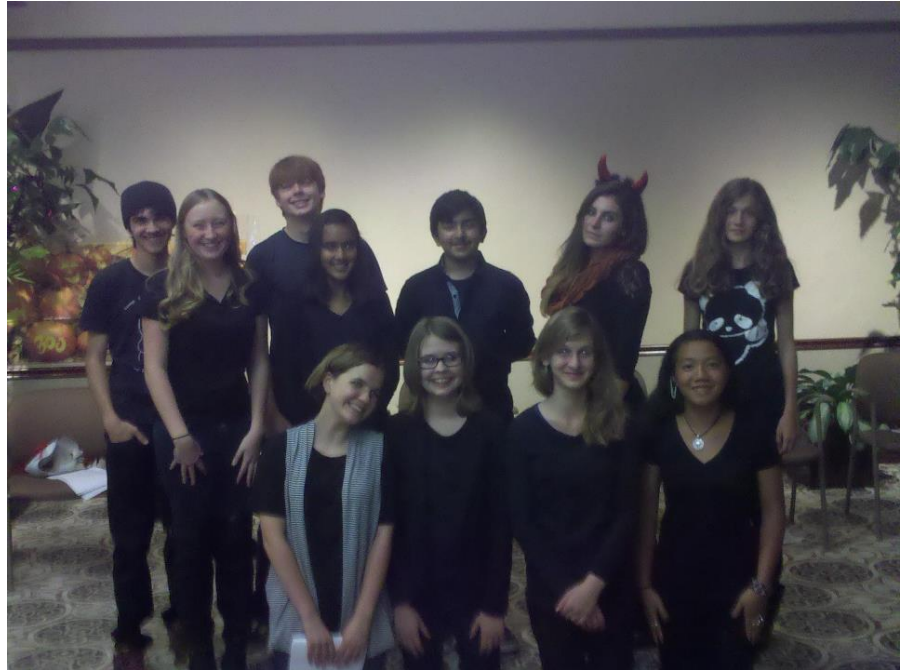
Teens at Burbank PL's Midsummer Night's Dream Event