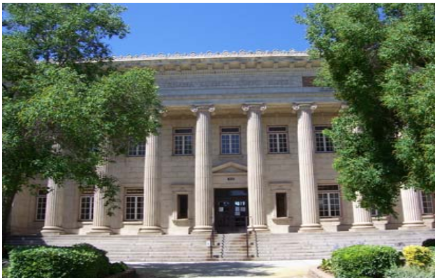
ERECTED IN 1920