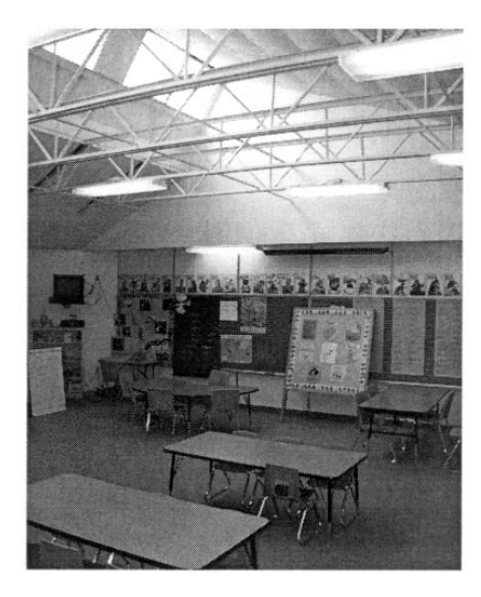
Figure 14—Interior of Fort Collins school with south-facing monitor.

light, were found to be testing 9 to 15 percent higher than those students in classrooms with the least window area or daylighting. A 6 to 7 percent effect is observed for the skylit classrooms.