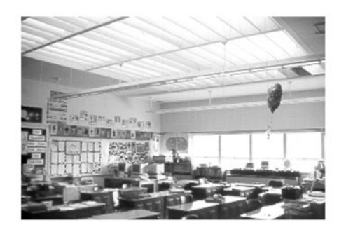
Figure 12—Seattle school with central skylight and diffusing louvers.

cific classroom location, but only by their grade level within a school. As a result the final analysis in Fort Collins was much simpler and more general than the other two districts. Luckily, most schools in Fort Collins had fairly uniform daylighting conditions for all their classrooms. Thus, an overall school daylighting code was a reasonable approximation of individual classroom conditions.