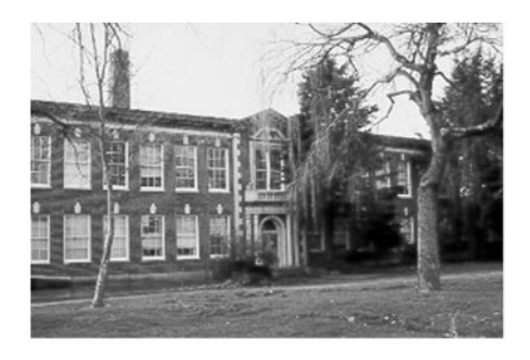
Figure 9—Older Seattle school, Window Code 4.