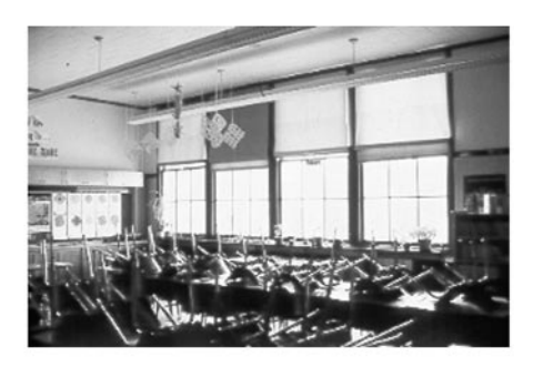
Figure 10-Older Seattle school, Window Code 4.

monitors or skylights. One school with open-type classrooms has high clerestory windows that allow daylight deep into the building ( Figure 11 ).