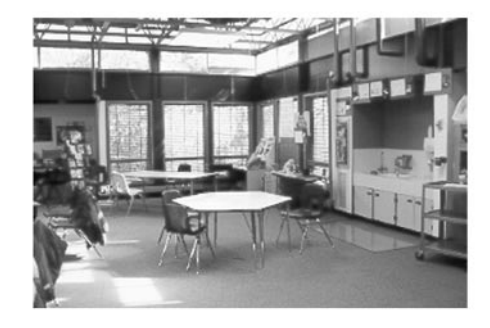
Figure 11—Seattle classroom with clerestory windows.

Due to the structure of the data sets given to us by Fort Collins, we were not able to identify students by their spe-