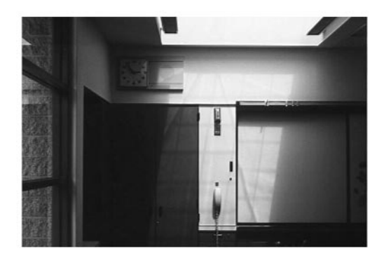
Figure 5—Type B skylight, Capistrano.

A Daylight Code combined the effects of both windows and skylights. It was assigned to each classroom based on a daylighting expert's assessment of the synthesis of the daylighting conditions expected from the combination of window conditions and any top-lighting found in each classroom. The criteria were based on