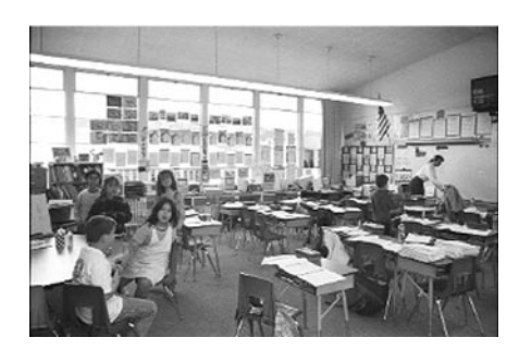
Figure 2—Classroom with window Code 5.

ety of skylight and monitor designs employed. Some designs allowed direct sun into the classrooms while others were diffusing. Some were designed to provide uniform illumination throughout the classroom; others created strong illumination gradients.