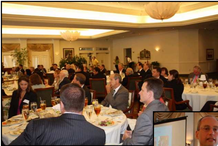
Everyone enjoying the lunch and program at Grey Oaks Country Club.