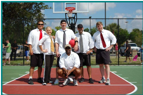
Best Team Name - "Bombarding Barristers"