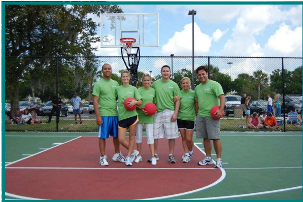
The Cohen & Grigsby Team