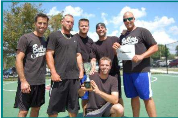
The 2009 Champions - "The Ballers"