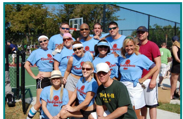
Our Friends with the CCYP