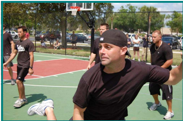
The thrill of victory!