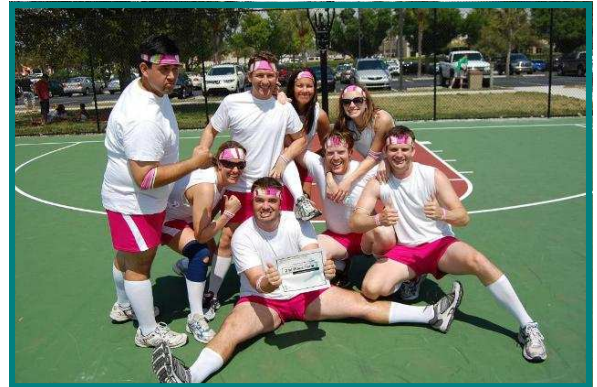
Second Place - "Dustin's Dumba$$@$"