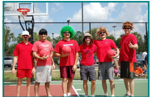
Sportsmanship Award - "On My Face, Please"