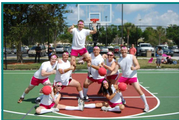
Best Costumes - Dustin's Dumba$$@$