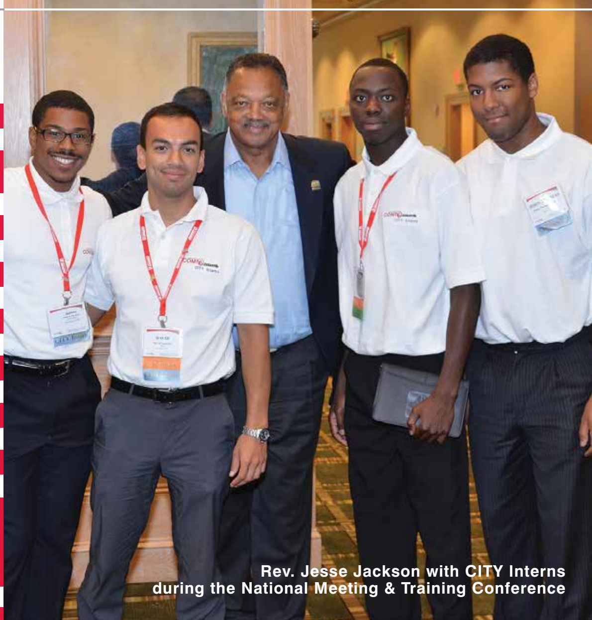
Rev. Jesse Jackson with CITY Interns during the National Meeting & Training Conference