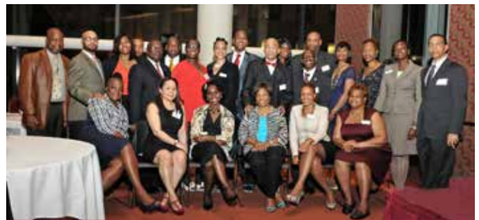
COMTO New York