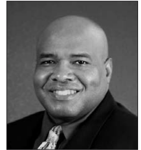
Warren Foster Bay Area Rapid Transit Oakland, CA