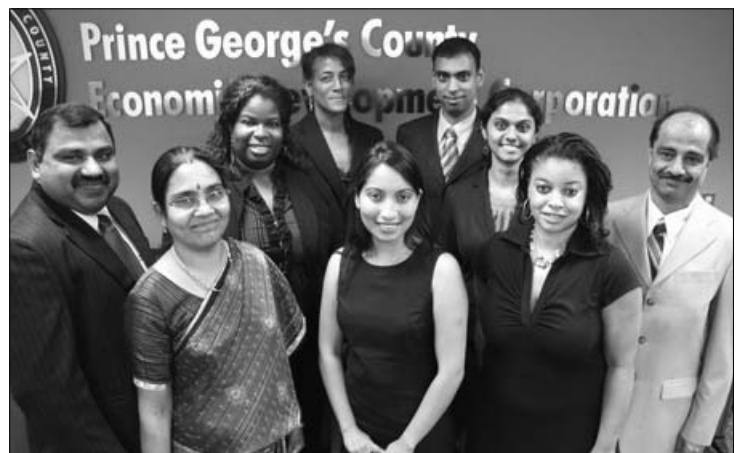
The Angarai Team

James L. Oberstar, Chairman House Committee on Transportation and Infrastructure July 31, 2009