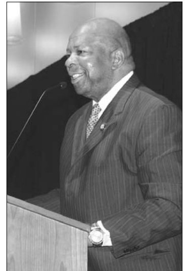
Congressman Elijah E. Cummings

All in attendance benefited from a lively, multi-faceted discussion of the stimulus package as it relates