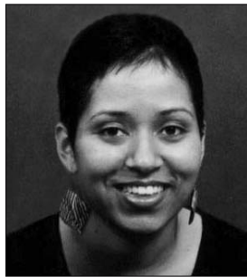
India Birdsong Service Planner Chicago Transit Authority Chicago, IL