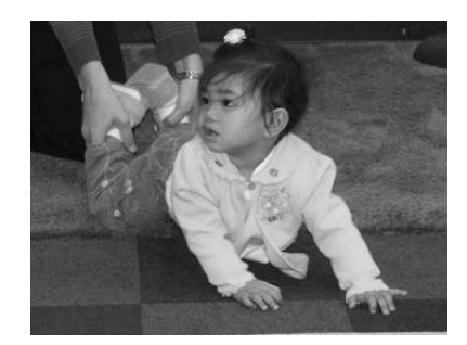
physically take Figure 21. Roll over - toddler.

and roll them over one complete revolution so as to return back to the original position. Conduct up to three consecutive revolutions. As you continue this procedure, see if the infant will initiate the movement on their own by grasping the legs or ankles and gently turning one leg over the other causing the hips to gently twist in an asymmetrical and out of balance position that is relieved by the infant following through on their own by rolling over. Carefully watch your infant's eyes to see if they are leading the body movement. As the infant begins to turn, the eye that is most visible should make a swinging movement in the direction of the turn. If you don't notice this, encourage the eyes to move by calling to the infant over the shoulder where you cannot initially be seen or by attracting the infant's attention with a penlight or brightly colored toy. Be sure to have the infant turn in both directions to give equal stimulation to both eyes and sides of the body.