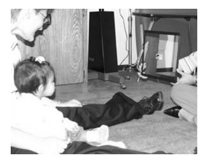
Figure 13. Mirror rotations.