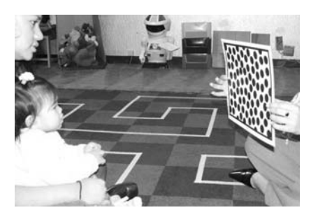
Figure 13. High contrast black and white targets.

encourages the infant's focus to begin to move out and explore space. Placing a sticker on the mirror induces the infant to alternate focus from the plane of the mirror, i.e., the sticker, to their reflected image behind the plane.