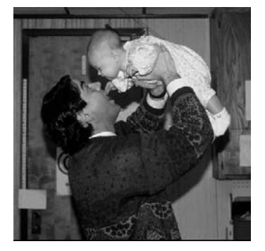
Figure 5. Completion of near point of convergence. Next return out to starting point.

activity can also be carried out with the infant reclining and the parent slowly approaching inward while maintaining eye contact.