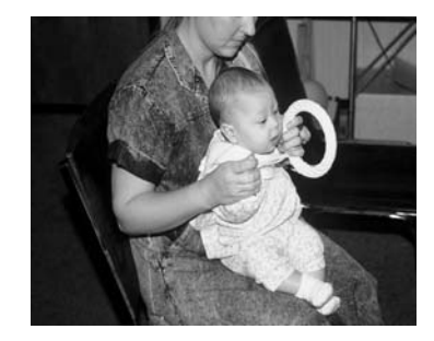
Figure 9. Pointer and soft pipe cleaner.

accuracy are displayed, increase the demand and expand flexibility by using smaller sized rings and by varying the location at which the ring is held. The task will be most challenging when the hole in the ring is