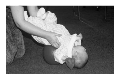
Figure 23. Wheelbarrow – supine position.

enjoyable activity where organized vision attention can develop.