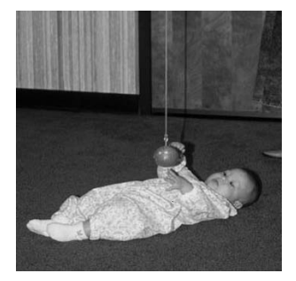
Figure 17. Swinging ball supine position.