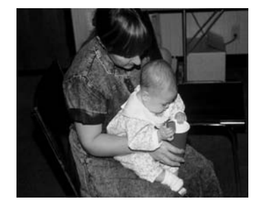
Figure 10. Block into cup.

The vision system initially learns how to calibrate space through the consequences of hand manipulation. By observing an object fall through space, the infant is provided the opportunity to understand that two areas can be visually related without being in physical contact. In