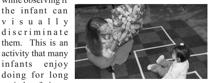
Figure 8. Peek-a-boo variation.

interest you can begin to increase the speed and rhythm of the infant's saccadic fixation and develop this important vision skill to a high degree.