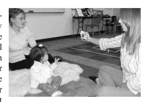
Figure 6. Left saccade.

closer to your face to play peek-auntil you actually boo using a pillow with your face noses. covered. Reveal Maintain eye contact during the whole your face from transit and observe behind and after the convergence vou make eve movement with the contact hide your face again. Repeat eyes as the infant from a different Continue to work the side each time procedure in reverse, you come around starting up close and from the pillow: slowly pushing the up, down, left, infant up and away right and each diagonal corner. are Randomize the extended. Repeat the procedure with the side you emerge slightly from and change torqued to one side or your expression the other to promote while observing if an asymmetrical the infant can convergence visually movement. This discriminate them. This is an activity that many infants enjoy