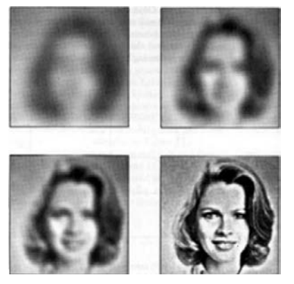
Figure 2. Simulation of how the infant sees during the first year. Printed with permission by author. <sup>8</sup>

reared kittens in an environment consisting of only vertical stripes.<sup>7</sup> After approximately 30 hours of abnormal vision experience, it was as if the kittens developed a simulated blindness, or amblyopia, resulting in delayed visual reaction time which was evidenced by their failure to blink for quickly approaching objects. Depth perception was also adversely affected, in that the kittens didn't put out their paws when slowly