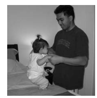
Figure 14. Bed trampoline.

stand on a stool so the infant can be more easily supported. Next, slowly lift the infant from the bed being careful to insure that both of the infant's arms are equally pulling on your fingers. After lifting the infant 15cm to 30 cm off the bed, slowly lower back down in contact with the bed. Repeat this cycle slowly