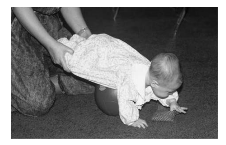
Figure 22. Wheelbarrow – prone position.