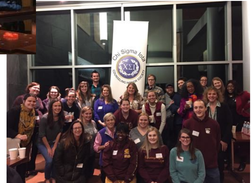
Screen Time & Mental Health Workshop

We are an award winning and innovative chapter!