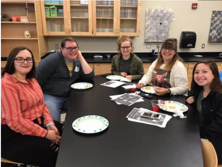
Domestic Violence Awareness Month