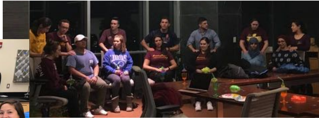
Massages & Mocktails Event