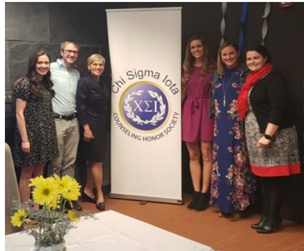
Executive Board at Initiation

Chapter was reactivated by new faculty and with renewed vision.