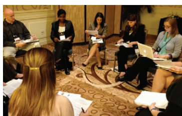
CSI Leaders' Group at ACA