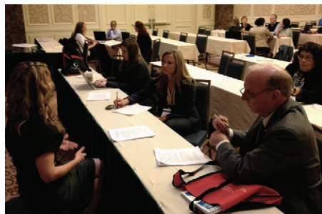
CSI Leaders' Group at ACA