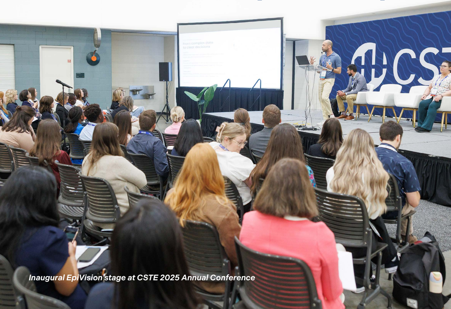
Inaugural EpiVision stage at CSTE 2025 Annual Conference