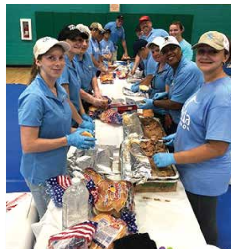
GeoVista staff serve families at Fort Stewart.