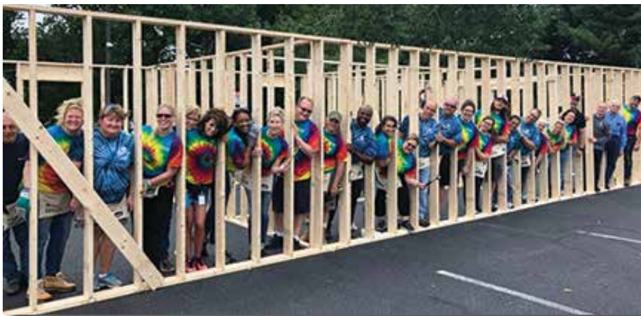
Dover FCU employees and board members.