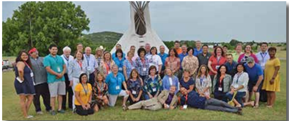
Attendees of Midwest Sub-Council.

March of Dimes leads the fight for the health of all moms and babies. They support research, lead programs, and provide education and advocacy so that every family can have the best possible start. Building on a successful 80-year legacy of impact and innovation, they stand up for every mom and every baby.