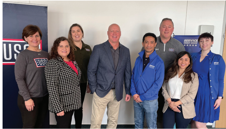
Service CU group