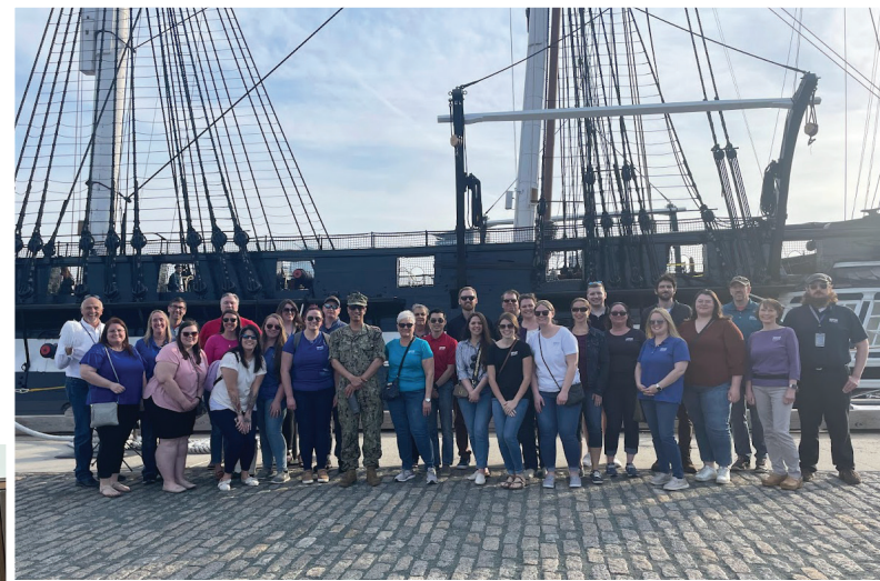
Above: USS Constitution