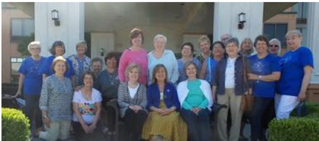
Daughters throughout Province VII gather at St. Christopher's Episcopal Church in Fort Worth, Texas.

On April 22-24, 2016, 112 Junior and senior Daughters attended the assembly for Province VII held in the diocese of Fort Worth at St. Christopher's Episcopal Church. The theme for my 3-year tenure is Micah 6:8, "... and what does the Lord require of you? To act justly and to love mercy and to walk humbly with your God." So for my first assembly I chose as the subject, "Justice."