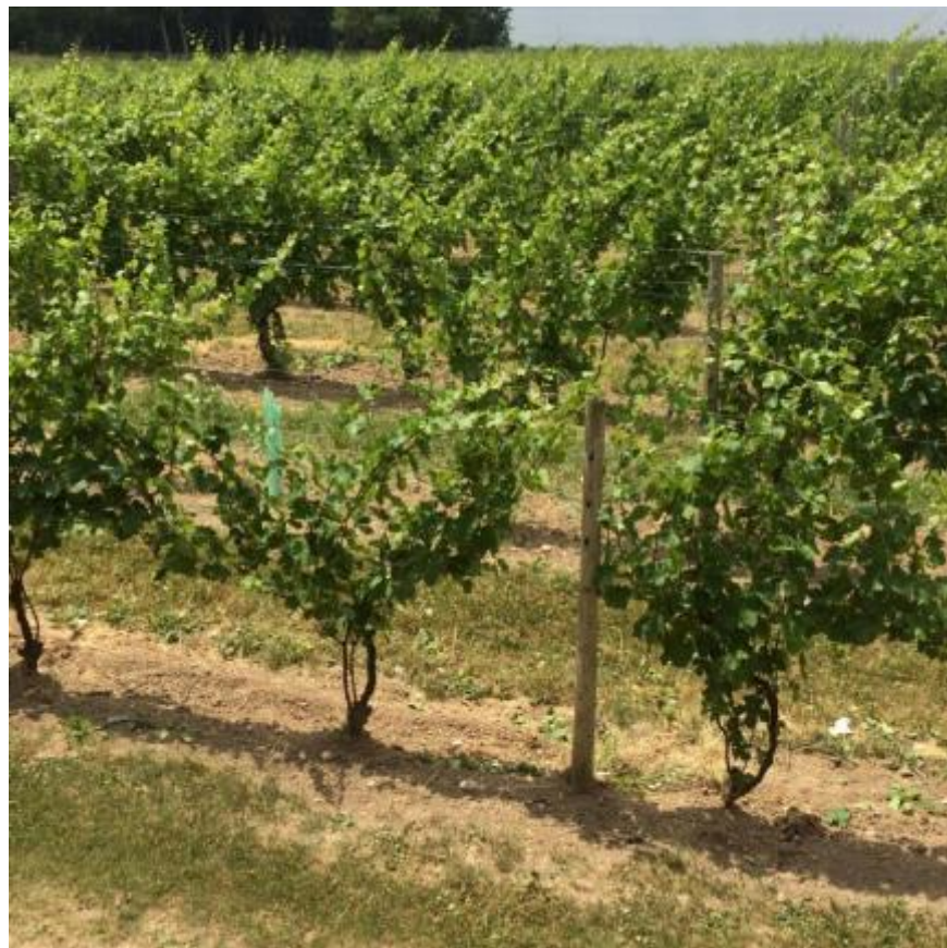
Grape vines along Wine Trail on Seneca Lake, New York